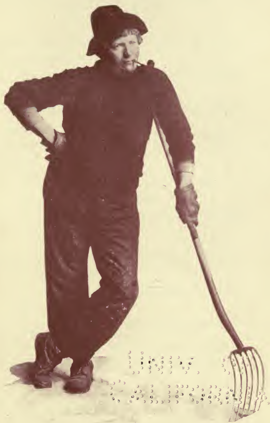
The Harvest Hand